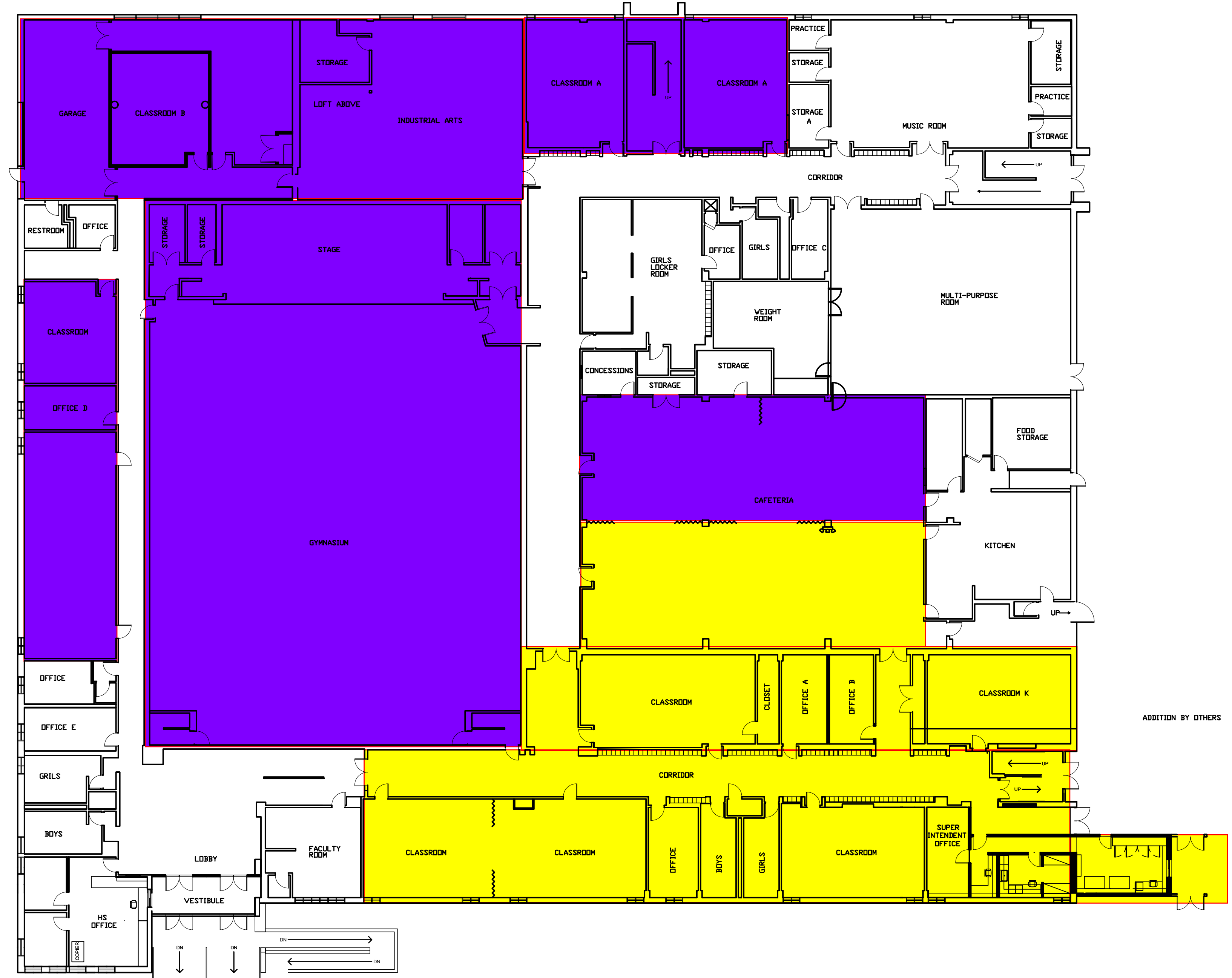
FIRST FLOOR - NEW FLOOR PLAN SCALE: 1/16" = 1'-0" NORTH